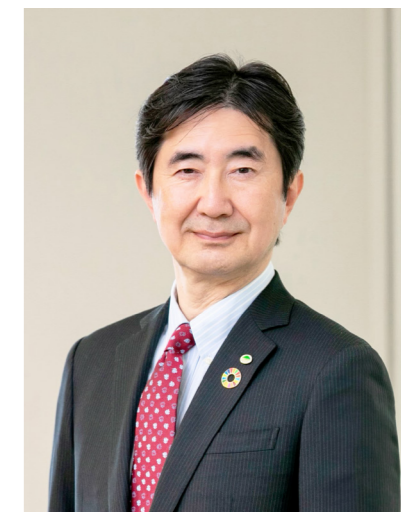
Hitachi Academy, President

to continue to learn in a rapidly changing society. To this end, we are expanding our human capital development programs globally, focusing on our core competencies in the areas of IT/OT*, DX/GX, as well as management, business, and leadership. We also aim to become a "Hub of Knowledge" where diverse people from around the world who aspire to growth can gather together and inspire one another. As a member of the Hitachi Group, which aims to realize a sustainable society and support people's happiness through data and technology, Hitachi Academy will continue to support the growth of people and businesses.